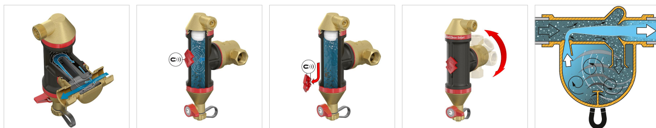
Selection table for Flamcovent & Clean Smart series